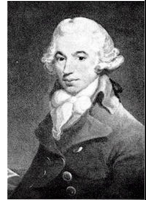
Bro. Ignaz Pleyel

(This article is a synopsis of a paper submitted to the NJ Lodge of Masonic Research and Education at its May 2003 Meeting. The paper is available, in its entirety, on our website – http://www.njlore1786.org )